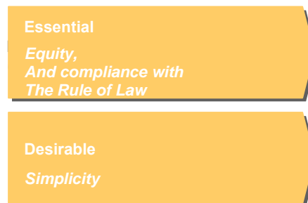
FIGURE 4: STAGE 3 - ADMINISTRATION

Under stage three, it is very important that a tax is able to be administered equitably, in compliance with the Rule of Law. The goal of administrative simplicity is of secondary importance. This is because, arguably, administrative costs are already minimised significantly under a self assessment system and, therefore, it is more important in such a system to pursue the goals of certainty and equity. However, where the tax is certain it is likely to also be capable of being administered cost effectively and therefore, where certainty is pursued it is likely that administrative costs will be minimised.