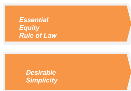
FIGURE 3: STAGE TWO - DRAFTING

The most important criteria in stage two is that a tax be implemented with certainty (thereby satisfying the Rule of Law) and maintains equity. Whilst an ideal tax would also satisfy the criterion of simplicity to the extent that this means the taxation measure conflicts with the attainment of certainty or equity arguably this should be attributed lower (desirable) importance when critiquing a tax under stage two.