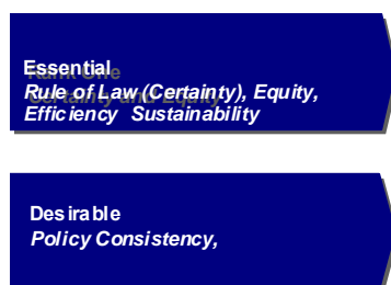
FIGURE 2: STAGE ONE - POLICY